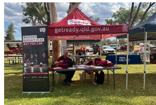
Our Get Ready Queensland team attended the Self Care, We Care Multicultural Festival held at Graham Andrews Park on 5 October. Further information sessions were held in Augathella and Morven on 10 October.

As part of the project, emergency management and community service personnel worked with people with disabilities to co-design tools and resources to reduce risk and increase resilience of people with disabilities to disaster. Visit www.collaborating4inclusion.org/disability-inclusive-disaster-risk-reduction/disability-inclusive-emergency-planning for more information.