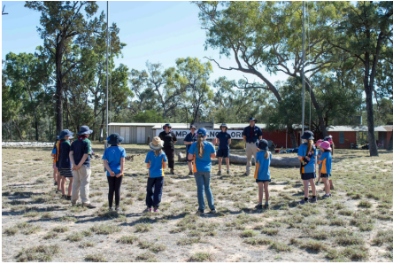
The 1st Charleville Girl Guides in action.